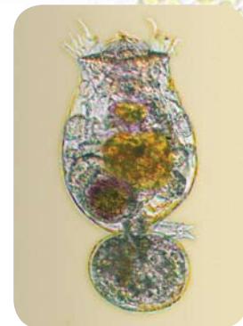
Rotifer ( Brachionus plicatilis ) grown using RotiGrow Plus